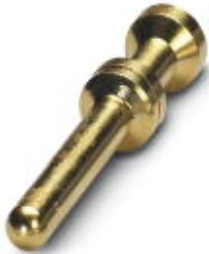
Turned 2.5 crimp contact, individual male contact, core diameter 4.00 mm 2 , gold-plated

Please be informed that the data shown in this PDF Document is generated from our Online Catalog. Please find the complete data in the user's documentation. Our General Terms of Use for Downloads are valid ( http://phoenixcontact.com/download )