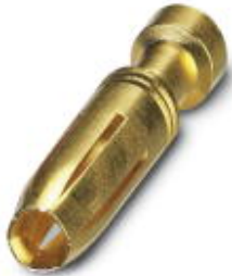
Turned 2.5 crimp contact, individual female contact, core diameter 2.5 mm 2 , gold-plated

Please be informed that the data shown in this PDF Document is generated from our Online Catalog. Please find the complete data in the user's documentation. Our General Terms of Use for Downloads are valid ( http://phoenixcontact.com/download )