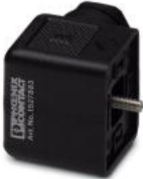
Valve connectors, 4-position, Valve connector A, Screw connection, cable gland Pg9, external cable diameter 6 mm ... 8 mm

Please be informed that the data shown in this PDF Document is generated from our Online Catalog. Please find the complete data in the user's documentation. Our General Terms of Use for Downloads are valid ( http://phoenixcontact.com/download )