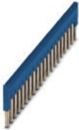
Plug-in bridge, pitch: 4.2 mm, number of positions: 20, color: blue

Please be informed that the data shown in this PDF Document is generated from our Online Catalog. Please find the complete data in the user's documentation. Our General Terms of Use for Downloads are valid ( http://phoenixcontact.com/download )