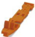
Latching, length: 63.6 mm, width: 9.7 mm, number of positions: 2, color: orange