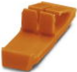
Latching, length: 29.8 mm, width: 10 mm, number of positions: 2, color: orange