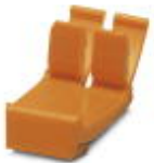
Latching, can only be released using a screwdriver, length: 23.2 mm, width: 9 mm, number of positions: 2, color: orange