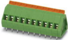
The figure shows the 10-position version

PCB terminal block, nominal current: 16 A, nom. voltage: 400 V, pitch: 5.08 mm, number of positions: 7, connection method: Spring-cage connection, mounting: Wave soldering, conductor/PCB connection direction: 45 °, color: green