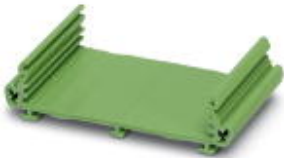
The figure shows the variant UM 45-Profil CM

Panel mounting base, length: 1000 mm, open, Lower part, Cross connection: without bus connector, color: green, width: 1000 mm, number of positions cross connector: not relevant, Note: required profile length = PCB length - 3.6 mm