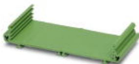
The figure shows the variant UM 45-Profil CM

Drawn section panel mounting base, with a constructional width of 108 mm and a fixed length of 200 cm