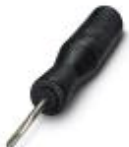
Assembly tool, for CK 1.6... crimp contacts for small conductor cross sections