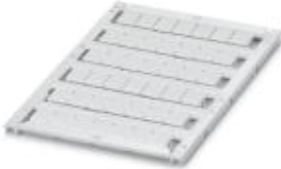
The figure shows the unlabeled version

Marker for terminal blocks, can be ordered: by sheet, white, labeled according to customer specifications, Mounting type: Snap into tall marker groove, for terminal block width: 8.2 mm, Lettering field: 7.6 x 10.5 mm