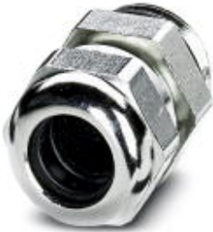
Cable gland, shielded: No, cable diameter range: 9 mm... 13 mm

Please be informed that the data shown in this PDF Document is generated from our Online Catalog. Please find the complete data in the user's documentation. Our General Terms of Use for Downloads are valid ( http://phoenixcontact.com/download )