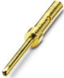
D-SUB crimp contact, connection method: Crimp connection, connection cross section: AWG 28-22, High Density

Please be informed that the data shown in this PDF Document is generated from our Online Catalog. Please find the complete data in the user's documentation. Our General Terms of Use for Downloads are valid ( http://phoenixcontact.com/download )