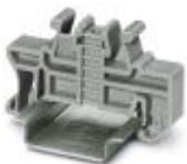
Quick mounting end clamp for NS 35/7,5 DIN rail or NS 35/15 DIN rail, with marking option, width: 9.5 mm, color: gray