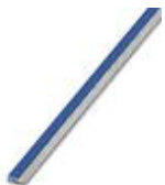
Continuous plug-in bridge, length: 500 mm, color: blue

Continuous plug-in bridge - FBST 500-PLC BU - 2966692