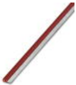
Continuous plug-in bridge, length: 500 mm, color: red

Continuous plug-in bridge - FBST 500-PLC RD - 2966786