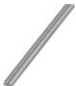
Continuous plug-in bridge, length: 500 mm, color: gray

Continuous plug-in bridge - FBST 500-PLC GY - 2966838