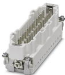
Contact insert, Size: B24, Number of positions: 24+PE, Male connector, Push-in connection, Number of connections per position: 2, 500 V, 10 A, 0.14 mm 2 ... 1.5 mm 2 , Application: Power

Please be informed that the data shown in this PDF Document is generated from our Online Catalog. Please find the complete data in the user's documentation. Our General Terms of Use for Downloads are valid ( http://phoenixcontact.com/download )