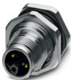
Flush-type connector, Power, 5-position, Plug, straight, M12, L-coded, Solder pins

Please be informed that the data shown in this PDF Document is generated from our Online Catalog. Please find the complete data in the user's documentation. Our General Terms of Use for Downloads are valid ( http://phoenixcontact.com/download )