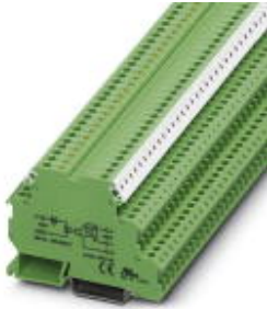
Power solid-state relay terminal block, input: DC voltage, output: DC voltage, input voltage: 12 V DC

Please be informed that the data shown in this PDF Document is generated from our Online Catalog. Please find the complete data in the user's documentation. Our General Terms of Use for Downloads are valid ( http://phoenixcontact.com/download )