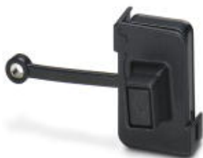
Sealing plug with locking for push-pull panel mounting frame, power (VS-PPC-F2...), IP65/67 degree of protection

Please be informed that the data shown in this PDF Document is generated from our Online Catalog. Please find the complete data in the user's documentation. Our General Terms of Use for Downloads are valid ( http://phoenixcontact.com/download )