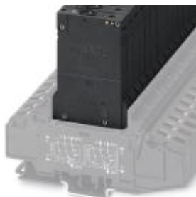
Thermomagnetic circuit breaker, 1-pos., normal blow, 1 N/O contact and 1 N/C contact

Please be informed that the data shown in this PDF Document is generated from our Online Catalog. Please find the complete data in the user's documentation. Our General Terms of Use for Downloads are valid ( http://phoenixcontact.com/download )