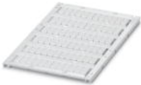
The figure shows the unlabeled version

Marker for terminal blocks, can be ordered: by sheet, white, labeled according to customer specifications, Mounting type: Snap into tall marker groove, for terminal block width: 5.2 mm, Lettering field: 4.55 x 10 mm