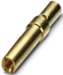
D-SUB crimp contact, Connection method: Crimp connection, Connection cross section: AWG 28-26

Please be informed that the data shown in this PDF Document is generated from our Online Catalog. Please find the complete data in the user's documentation. Our General Terms of Use for Downloads are valid ( http://phoenixcontact.com/download )