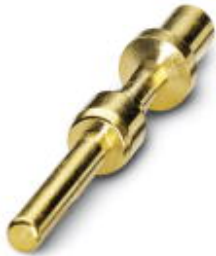
Crimp contact, turned, Single contact, Contact diameter: 3.6 mm, Crimp range: 2.5 mm 2 ...4 mm 2

Please be informed that the data shown in this PDF Document is generated from our Online Catalog. Please find the complete data in the user's documentation. Our General Terms of Use for Downloads are valid ( http://phoenixcontact.com/download )