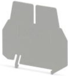
Separating plate, Length: 66.5 mm, Width: 1 mm, Height: 62.5 mm, Color: gray

Please be informed that the data shown in this PDF Document is generated from our Online Catalog. Please find the complete data in the user's documentation. Our General Terms of Use for Downloads are valid ( http://phoenixcontact.com/download )