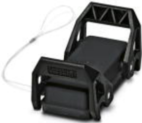
HEAVYCON protective cover, B16, for HC-EVO-B16... sleeve housing, with double locking latch, with retaining cord, IP54

Please be informed that the data shown in this PDF Document is generated from our Online Catalog. Please find the complete data in the user's documentation. Our General Terms of Use for Downloads are valid ( http://phoenixcontact.com/download )