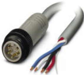
Bus system cable, DeviceNet™, 5-position, PVC, gray, Plug straight 7/8"-16UNF, on free cable end, Cable length: 5 m

Please be informed that the data shown in this PDF Document is generated from our Online Catalog. Please find the complete data in the user's documentation. Our General Terms of Use for Downloads are valid ( http://phoenixcontact.com/download )