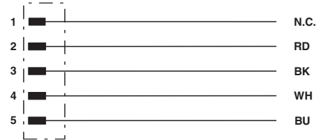
Contact assignment of the 7/8" connector and the 7/8" socket