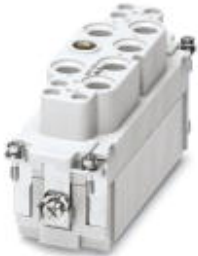
HEAVYCON socket insert, K6/6 series, for 6 power and 6 control contacts and PE, axial screw connection (power contacts)/screw connection (control contacts)

Please be informed that the data shown in this PDF Document is generated from our Online Catalog. Please find the complete data in the user's documentation. Our General Terms of Use for Downloads are valid ( http://phoenixcontact.com/download )