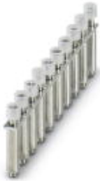
Fixed bridge, Pitch: 8.2 mm, Number of positions: 10, Color: silver

Please be informed that the data shown in this PDF Document is generated from our Online Catalog. Please find the complete data in the user's documentation. Our General Terms of Use for Downloads are valid ( http://phoenixcontact.com/download )