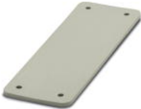
HEAVYCON cover plate, for panel cutouts of type B10/HV3, 3.5 mm thick, gray

Please be informed that the data shown in this PDF Document is generated from our Online Catalog. Please find the complete data in the user's documentation. Our General Terms of Use for Downloads are valid ( http://phoenixcontact.com/download )