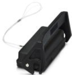
HEAVYCON protective cover, B16, for HC-EVO-B16... sleeve housing, with single locking latch, with retaining cord, IP54

Please be informed that the data shown in this PDF Document is generated from our Online Catalog. Please find the complete data in the user's documentation. Our General Terms of Use for Downloads are valid ( http://phoenixcontact.com/download )