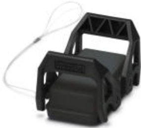
HEAVYCON protective cover, B10, for HC-EVO-B10... sleeve housing, with double locking latch, with retaining cord, IP54

Please be informed that the data shown in this PDF Document is generated from our Online Catalog. Please find the complete data in the user's documentation. Our General Terms of Use for Downloads are valid ( http://phoenixcontact.com/download )