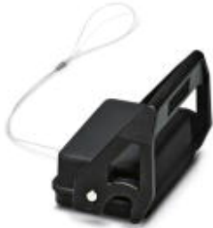
HEAVYCON protective cover, B6, for HC-EVO-B06... sleeve housing, with single locking latch, with retaining cord, IP54

Please be informed that the data shown in this PDF Document is generated from our Online Catalog. Please find the complete data in the user's documentation. Our General Terms of Use for Downloads are valid ( http://phoenixcontact.com/download )