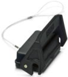
HEAVYCON protective cover, B10, for HC-EVO-B10... sleeve housing, with single locking latch, with retaining cord, IP54

Please be informed that the data shown in this PDF Document is generated from our Online Catalog. Please find the complete data in the user's documentation. Our General Terms of Use for Downloads are valid ( http://phoenixcontact.com/download )