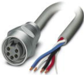
DeviceNet™ thin flush-type plug, 5-pos., 7/8", front mounting with 7/8" fastening thread, with 1.0 m PE litz wire

Please be informed that the data shown in this PDF Document is generated from our Online Catalog. Please find the complete data in the user's documentation. Our General Terms of Use for Downloads are valid ( http://phoenixcontact.com/download )