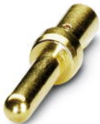
Crimp contact, turned, Single contact, Contact diameter: 1 mm, Crimp range: 0.08 mm²...0.22 mm²

Please be informed that the data shown in this PDF Document is generated from our Online Catalog. Please find the complete data in the user's documentation. Our General Terms of Use for Downloads are valid ( http://phoenixcontact.com/download )