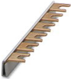
Wiring bridge for modules with connecting pitch 17.5 mm, 1-phase, 12-pos.

Please be informed that the data shown in this PDF Document is generated from our Online Catalog. Please find the complete data in the user's documentation. Our General Terms of Use for Downloads are valid ( http://phoenixcontact.com/download )