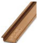
DIN rail, material: Copper, unperforated, height 7.5 mm, width 35 mm, length: 2 m

DIN rail, unperforated - NS 35/ 7,5 CU UNPERF 2000MM - 0801762