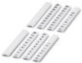
Zack Marker strip, flat, can be ordered: Strip, white, labeled according to customer specifications, Mounting type: Snap into flat marker groove, for terminal block width: 5 mm, Lettering field: 5.15 x 5.15 mm

Zack Marker strip, flat - ZBF 5 CUS - 0825025