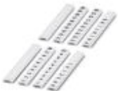
Zack Marker strip, flat, Strip, white, labeled, Printed horizontally: Consecutive numbers 1 - 10, 11 - 20, etc. up to 491 - 500, Mounting type: Snap into flat marker groove, for terminal block width: 5 mm, Lettering field: 5.15 x 5.15 mm

Zack Marker strip, flat - ZBF 5,LGS:FORTL.ZAHLEN - 0808671