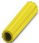
Insulating sleeve, Color: yellow