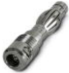
Test plugs, Color: silver