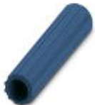
Insulating sleeve, Color: blue