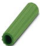
Insulating sleeve, Color: green