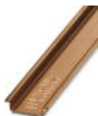
DIN rail, material: Copper, unperforated, height 7.5 mm, width 35 mm, length: 2 m

DIN rail, unperforated - NS 35/ 7,5 CU UNPERF 2000MM - 0801762