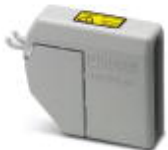
Covering hood, Width: 36.8 mm, Height: 65.5 mm, Color: gray