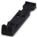
Strain relief, Number of positions: 2, Color: black