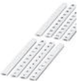
Zack Marker strip, flat, Strip, white, unlabeled, can be labeled with: CMS-P1-PLOTTER, PLOTMARK, Mounting type: Snap into flat marker groove, for terminal block width: 8 mm, Lettering field: 5.15 x 8.15 mm

Zack Marker strip, flat - ZBF 8:UNBEDRUCKT - 0808781