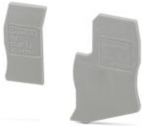
Cover segment, Length: 72 mm, Height: 36.5 mm, Color: gray

Please be informed that the data shown in this PDF Document is generated from our Online Catalog. Please find the complete data in the user's documentation. Our General Terms of Use for Downloads are valid ( http://phoenixcontact.com/download )