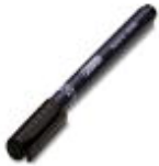
Marker pen, for manual labeling of unprinted Zack strips, smear-proof and waterproof, line thickness 0.5 mm