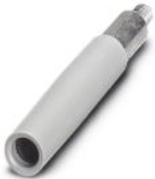
Female test connector, Color: transparent

Please be informed that the data shown in this PDF Document is generated from our Online Catalog. Please find the complete data in the user's documentation. Our General Terms of Use for Downloads are valid ( http://phoenixcontact.com/download )