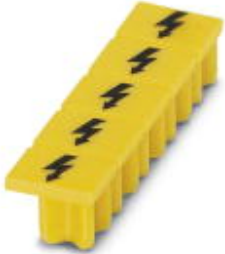
Warning cover, Strip, yellow, labeled, Mounting type: Plug in, Lettering field: 4.25 x 3.55 mm

Please be informed that the data shown in this PDF Document is generated from our Online Catalog. Please find the complete data in the user's documentation. Our General Terms of Use for Downloads are valid ( http://phoenixcontact.com/download )