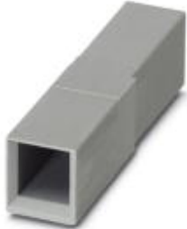
Connector housing, Number of positions: 1, Color: gray

Please be informed that the data shown in this PDF Document is generated from our Online Catalog. Please find the complete data in the user's documentation. Our General Terms of Use for Downloads are valid ( http://phoenixcontact.com/download )