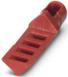
Coding profile for HC-MOD-K... housing

Please be informed that the data shown in this PDF Document is generated from our Online Catalog. Please find the complete data in the user's documentation. Our General Terms of Use for Downloads are valid ( http://phoenixcontact.com/download )