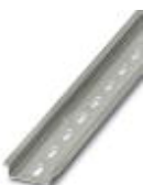
DIN rail, material: steel galvanized and passivated with a thick layer, perforated, height 7.5 mm, width 35 mm, length: 2000 mm

DIN rail perforated - NS 35/ 7,5 PERF 2000MM - 0801733