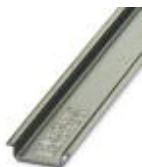
DIN rail, material: Steel, unperforated, height 7.5 mm, width 35 mm, length: 2 m

DIN rail, unperforated - NS 35/ 7,5 UNPERF 2000MM - 0801681