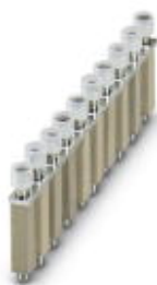
Fixed bridge, Pitch: 8.2 mm, Number of positions: 10, Color: silver

Please be informed that the data shown in this PDF Document is generated from our Online Catalog. Please find the complete data in the user's documentation. Our General Terms of Use for Downloads are valid ( http://phoenixcontact.com/download )