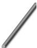
Connection pin, Length: 1000 mm, Color: gray